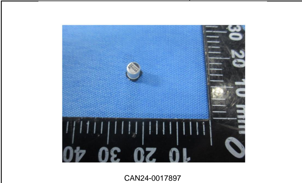
Photo of Submitted Sample

SGS authenticate the photo on original report only